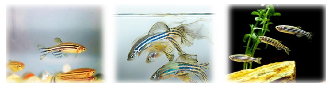
Figure 2. Adult zebrafish illustration.

The zebrafish was described in 1882 by Francis Hamilton, who found it near the Ganges River in India [19]. After George Streisinger first used the zebrafish to study vertebrate development in the 1980s, it has become one of the most important laboratory animals with unprecedented speed [8]. Zebrafish are native to most of the Indian subcontinent, from Pakistan in the west through India, Nepal and Bangladesh to Myanmar in the east. Zebrafish can be found in a wide variety of habitats. The adult zebrafish is 2 to 4 cm long, and its body is characterized by zebra-like stripes (Figure 2).