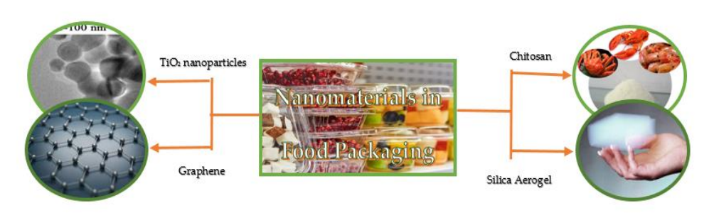
Figure 1. The most eminent nanomaterials for food packaging applications in literature.

It is important to produce to packaging material which has resistance to steam and atmospheric gases. Besides that, mechanical and thermal stability are another desired properties for food packaging. Up to now, non-biodegradable petroleum based plastic packaging materials have been used in food industry. Nowadays, with respect to green approach, researchers have been studied in nanomaterials for food packaging [18]. In Figure 1, it was shown the most used nanomaterials in food packaging.