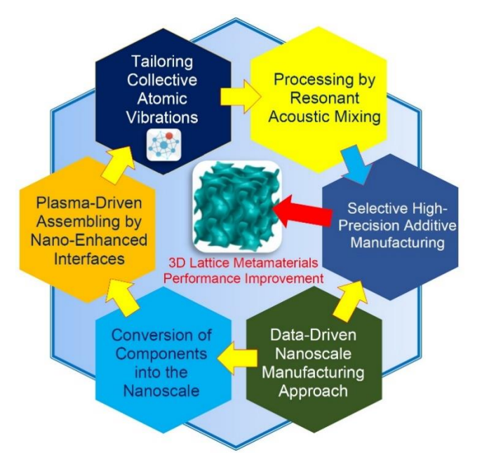
Figure 2. Schematic representation of the multistage technological chain.

For predictive excitation and adjustment of this phenomenon, we propose incorporation of the low-dimensional nanocarbon-based multilayer interfaces into the transition domains of nanocomponents via a multistage technological chain. In particular, this chain includes combination of a set of techniques: conversion of all components into the nanoscale, the plasma-driven functionalization and assembling with multilayer nano-enhanced interfaces, the energy-driven initiation of the allotropic phase transformations, the surface acoustic waves-assisted micro/nano- manipulation during the ion-assisted pulseplasma functionalizing, the heteroatom doping, initiating directed self-assembly through application external high-frequency electro-magnetic fields, the resonant acoustic mixing of all nanocomponents, growing the high-end ELM elements by high-precision multi-material additive manufacturing as well as using the data-driven digital twins-based nanoscale manufacturing approach. The proposed technological chain is schematically shown in Figure 2.