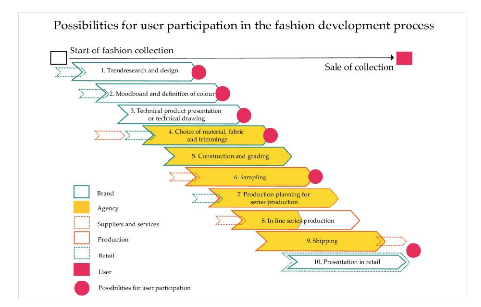
Figure 1. Possibilities for user participation in the fashion development process.

Mass customisation (MC) and open innovation (OI) are innovative strategies that involve customers or external experts in product development and enable interactive value creation. While mass customisation aims at the production of a single personalised product, open innovation aims at the open development of a new product for a large group of customers [14]. MC and OI receive little attention from the major players in the garment industry. Customers remain predominantly in the passive role of the recipients [15]. Some companies are testing mass customisation as a complementary concept to their traditional product development [16]. On the other hand, open innovation approaches are not yet anchored in mass production in the garment industry. Based on this, Figure 1 shows the process steps in which user participation is theoretically possible within the fashion development of the agency business.