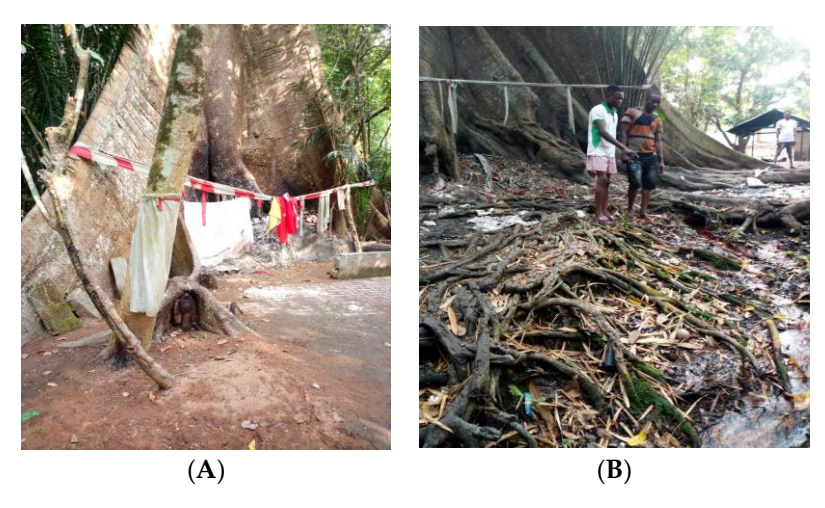
Figure 1. ( A ) Some areas of the groove surrounding the river source are restricted to visitors, Spiritual affiliation ( B ) River Ethiope, unlike sources of other rivers, originated from the foot of a giant silk-cotton tree, the river sprouts out from four different locations with two of these locations directly underneath the tree, while the other two from around the tree.

Nigeria at large. The River Ethiope in Delta State, Nigeria originates from the foot of a giant silk-cotton tree and is unique for its cavernous size and unnaturally pure water. Despite appearing shallow, the river is deep enough to accommodate ocean-going vessels. Its source is considered sacred and some areas are restricted to visitors due to their spiritual affiliation, with a footpath leading to the Onoku shrine. However, much of its biotic information (macrophyte and physicochemical variables) is still unknown. Therefore, this study is aimed at providing baseline information on the species richness of aquatic macrophytes and physicochemical variables.