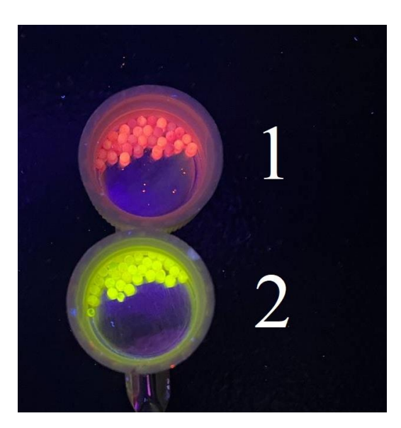
Figure 1. Fluorescent tracers under UV light. tracers based on superabsorbent polymer loaded with Rhodamine B (1); tracers based on superabsorbent polymer loaded with fluorescein (2).

Furthermore, in this work, we investigated properties required for use of materials in downhole applications. Specifically, we conducted hot rolling tests for fluorescent tags that simulates mud circulation in the well in the presence of drill cuttings and without it. This way we studied the compatibility of SAP-based fluorescent tracers with oil-based drilling fluid. Moreover, this test can be used to assess long-term stability and the possibility of recovery of the tags.