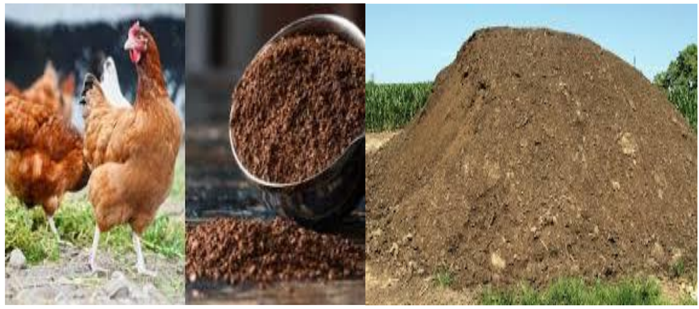
Figure 2: Poultry Litter.

Renewable and sustainable energy : Energy sources that has less environmental effect, cheap and abundantly.