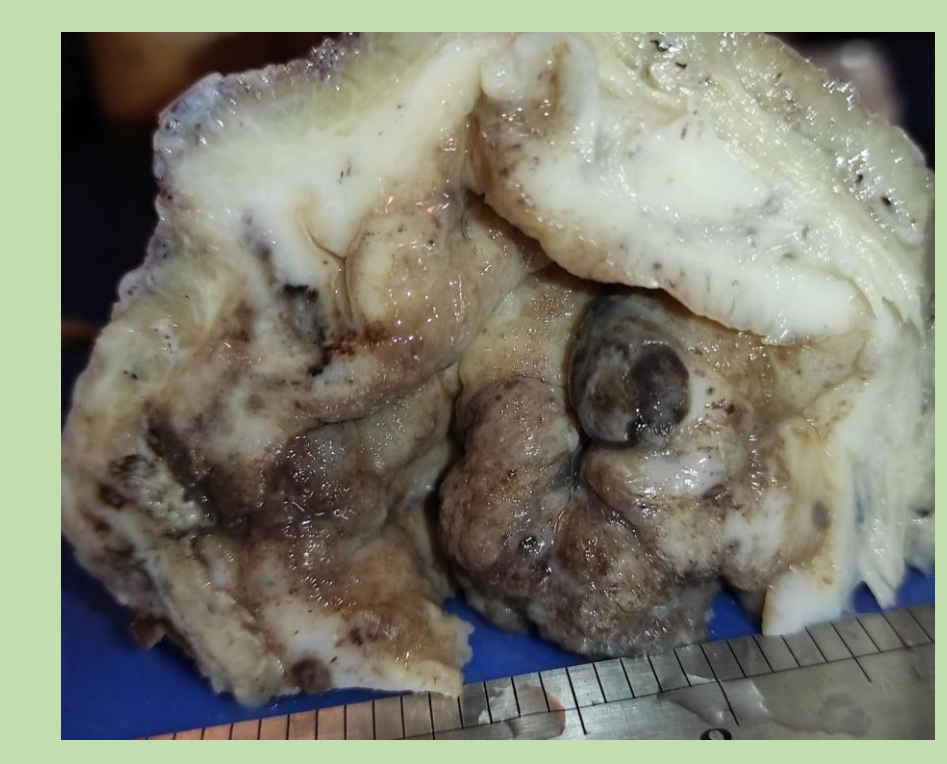
Figure 4. Bladder tumor in cattle