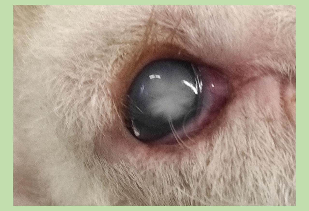
Figure 3. Blindness in sheep

Based on the cases received at the Histology and Anatomical Pathology and at the Veterinary Hospital of UTAD (Vila Real, Portugal), the authors describe the main animal syndromes associated with the ingestion of P. aquilinum in ruminants, based on the literature