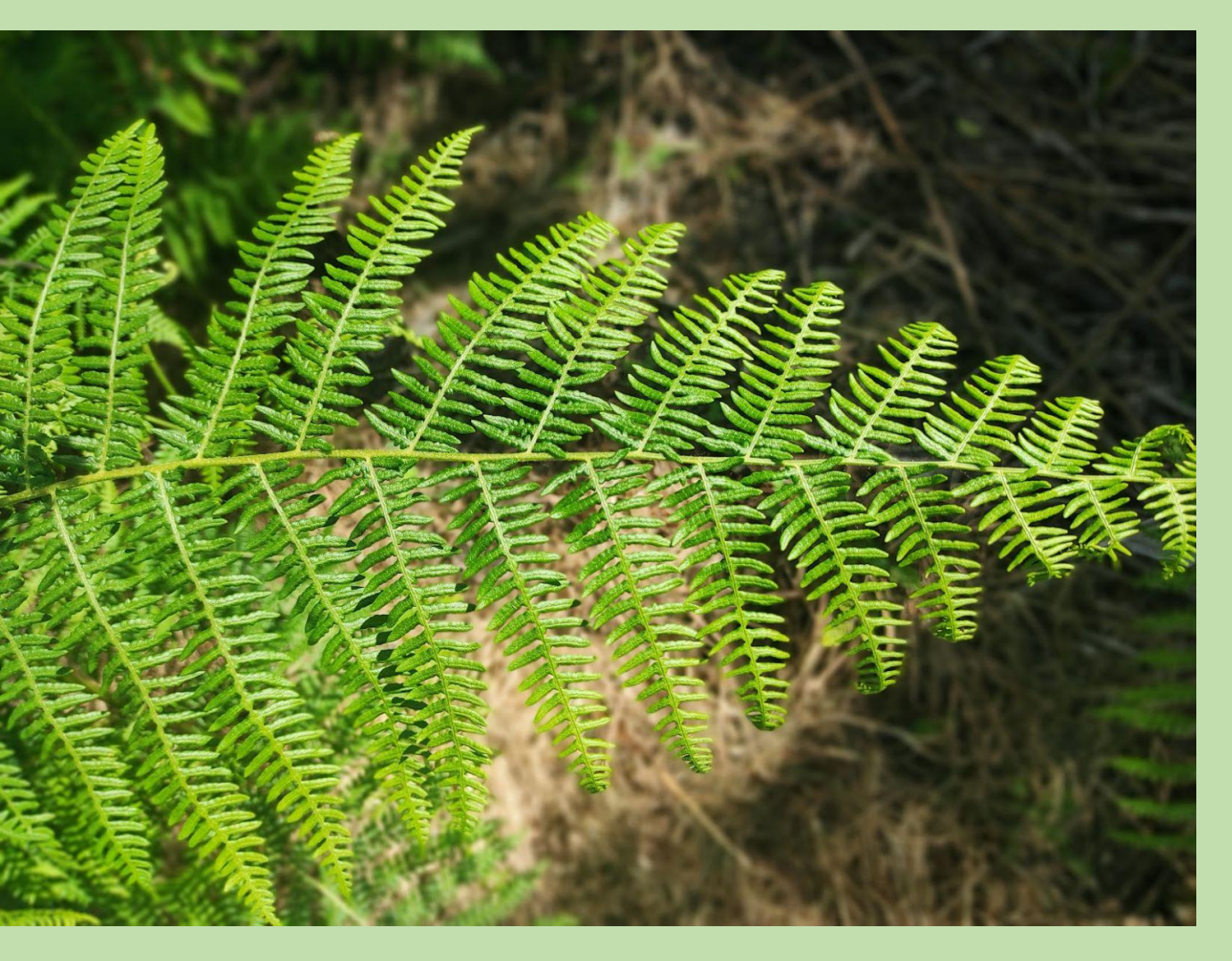
Figure 2. Bracken Fern.

The morphology of the plant can be categorized into three main parts: roots, rhizomes, and fronds, with the fronds featuring fiddleheads in their immature stage (Figure 2). As the Bracken fern (BF) develops, the fiddlehead progressively unfurls, eventually giving rise to mature fronds responsible for the dispersal of required for essential spores reproduction [4-5].