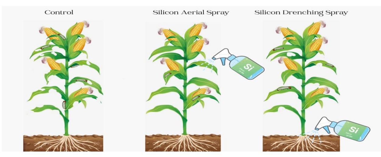
Figure 1. Schematic illustration of the maize plant for Silicon application.

Maize plants were treated with Silicon dioxide (SiO<sub>2</sub>) using drenching or foliar treatment methods, each with a concentration of 400 ppm, 800 ppm and 1200 ppm. Drenching treatments were sprayed directly to the soil, while foliar applications were performed with the use of a sprayer (1-L spray bottle). Moreover, the water application served as the untreated control. During the process of the analysis, maize plants were exposed to silicon treatment three times after 15 days of seedling emergence and following 10 days interval. Fall armyworm population was recorded in the field after silicon exposure at different concentrations on datasheets.