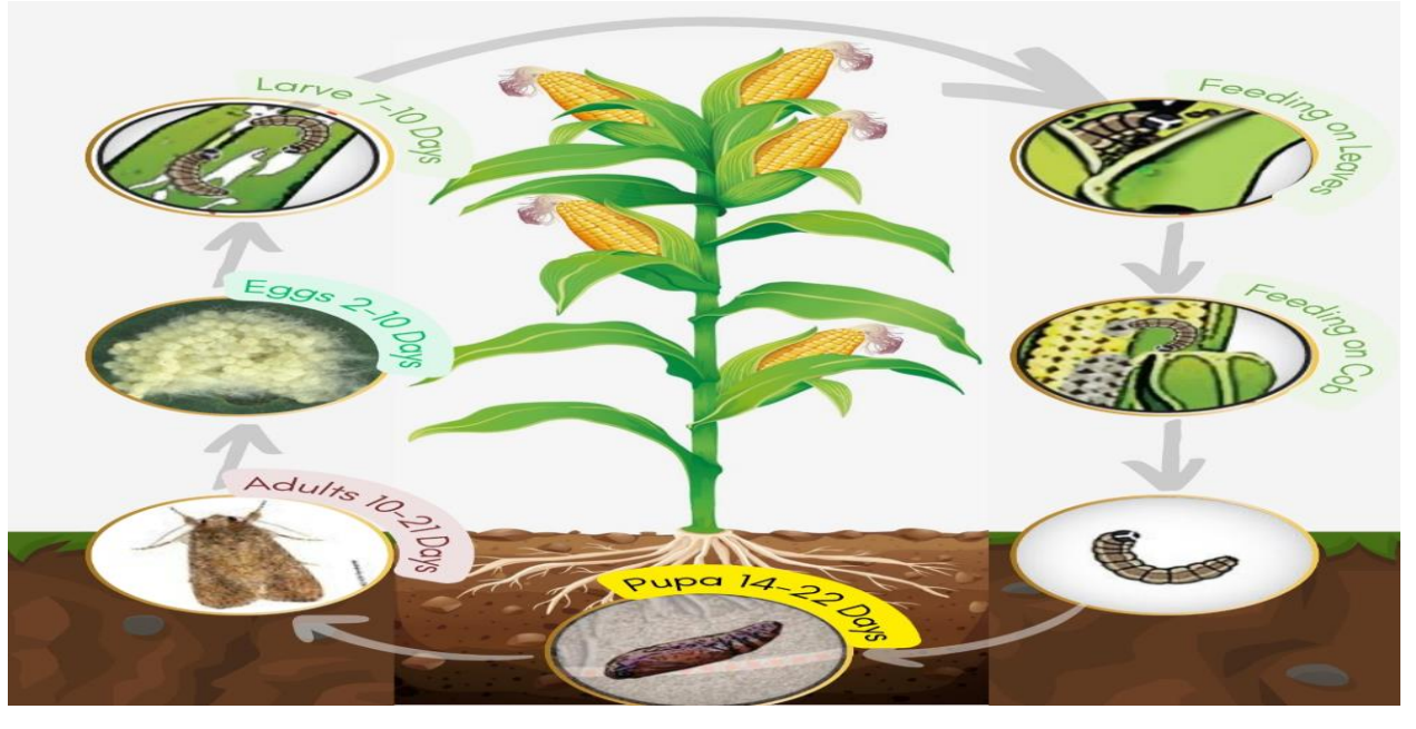
Figure 3. Schematic illustration of Fall Armyworm (FAW) biology.