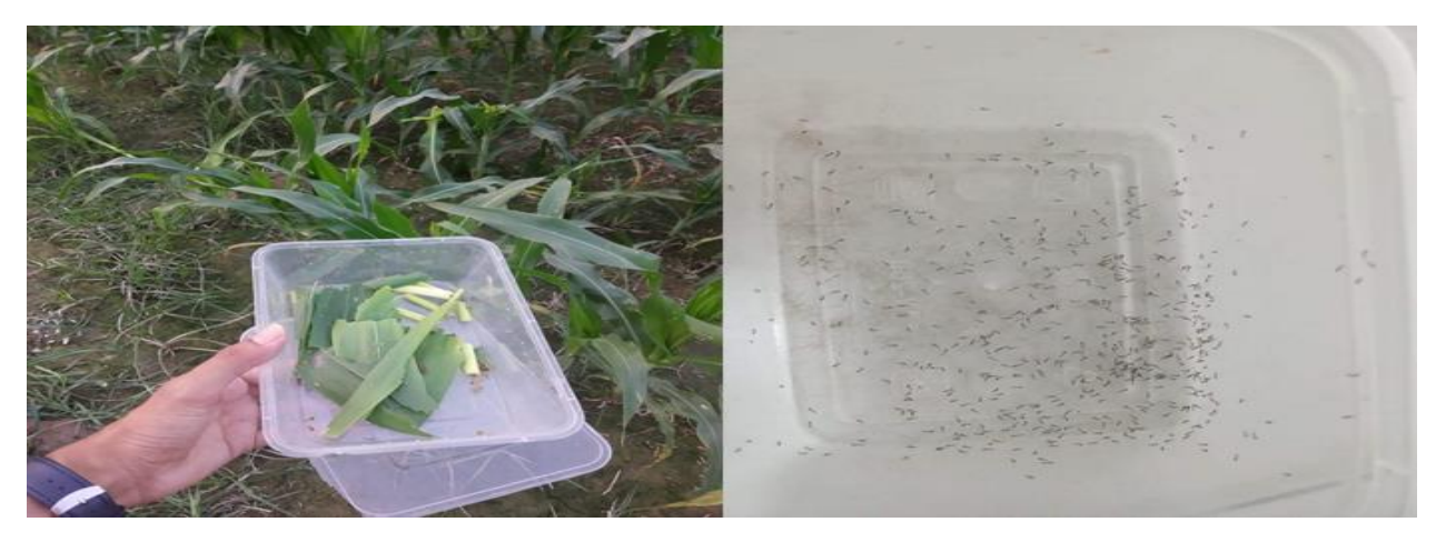
Figure 2. Collection of the larvae from FAW infested field.

was maintained at 25 \pm 5 °C temperature, 65 \pm 5 relative humidity, and 16:8 (L:D) hours photoperiod in a growth chamber. The F1 generation was fed until pupation on the silicon-treated maize leaves, and the biological parameters (larval duration, survival, pupal duration, adult longevity, and fecundity) were recorded regularly. For each treatment counted numbers of specimens were used to assess the effect of silicon on biology. In control treatments, silicon-free leaves were offered to larvae on the regular basis.