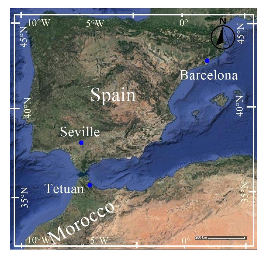
Figure 1. Study areas Tetuan, Morocco and Seville, Barcelona, Spain.

Questionnaires were administered over various days in June 2022 in Tetuan, Morocco (35.5889° N, 5.3626° W), and on distinct days of June 2023 in Seville (37.3891° N, 5.9845° W) and Barcelona (41.3874° N, 2.1686° E), Spain.