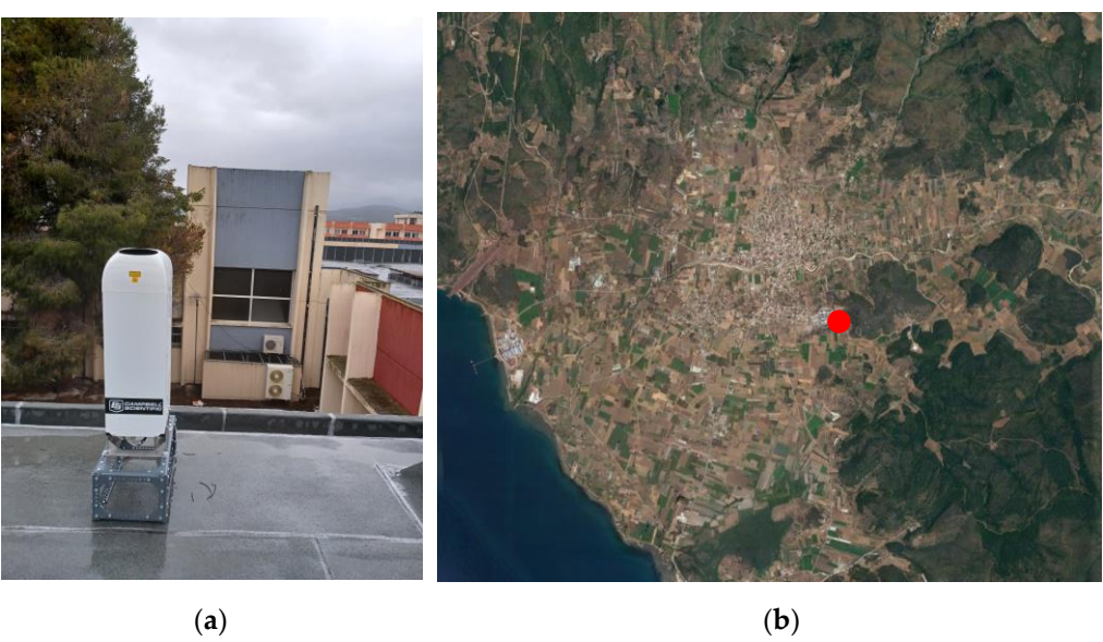
Figure 1. (a) Campbell Ceilometer C135 which is operating in the National Kapodistrian University of Athens (Greece), Department of Aerospace Science and Technology in the facilities of Euboea Island. (b) The greater area around the ceilometer (red dot).

In order to identify the mean daily variation of MLH, the final datasets split by months (June, July and August) and the mean hourly MLH was calculated (Figure 2). Using the provided estimations of the MLH from the ceilometer, the weighted hourly mean MLH was calculated.