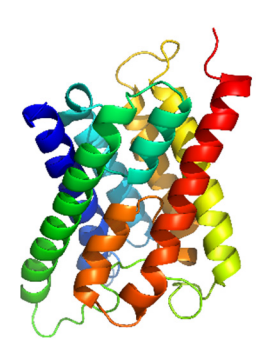
Figure 1. 3D structure of AQP3 from Protein Data Bank.

The AQP3 protein (PDB ID: 3LLQ) (Figure 1) was used to fit the three-dimensional structure of the AQP3. The protein was obtained in the pdb format from the Protein Data Bank [16]. Using AutoDock version 4.2, the protein model was prepared by eliminating water molecules, cutting out superfluous chains, and adding polar hydrogen and charges. After processing, the protein structure was saved in the pdb and pdbqt formats for additional in silico study.