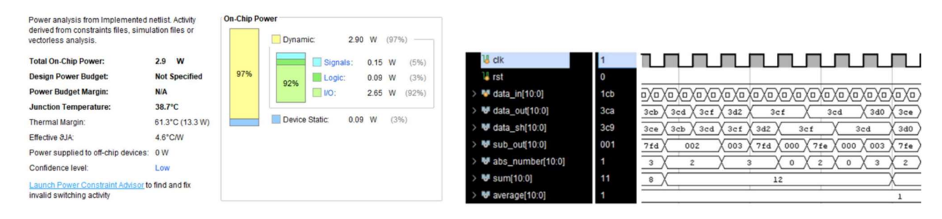
Figure 3. Power report and outputs of various subsystems.