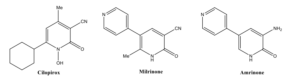
Figure 1. Examples of drugs with 2-pyridone moiety

Multicomponent reactions (MCRs) are considered as a powerful method in developing green synthetic strategy. They are known to make a unique product selectively via three or more components in only one step [9]. Moreover, MCRs form one of the most efficient tools in new chemical synthesis, with high atom economy, rapid and easy implementation, environmentally friendly and a various target-oriented synthesis [10]. In addition, the use of organic synthesis under free solvent conditions is one of the fundamental objectives of green chemistry. These reactions are much facile for the work up and proceed effectively and cleanly. Therefore, these reactions acquired high celebrity and worth rapidly. [11]