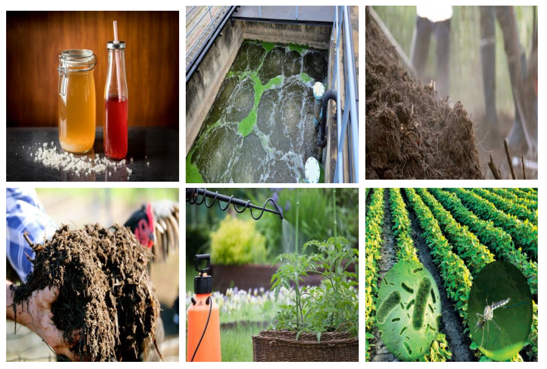
Figure 2. Usage areas of EMOs. (adapted from https://www.permaculturenews.org/2016/01/19/what-are-effective-microorganisms/; https://aosts.com/role-microbes-microorganisms-used-wastewater-sewage-treatment/; https://www.smilinggardener.com/collection/effectivemicroorganisms/.

effluent in their study. Commercial EMO consists Rhodopseudomonas sp., Lactobacillus sp., and Saccharomyces sp. Research results showed that the removal efficiency of inorganic compounds in wastewater was >60%. EMO effectiveness has been tested in the production of eco-enzymes from food waste for wastewater treatment [39]. Moreover, EMO has many functions, including biostimulant, and plays an effective role in the biosorption of heavy metals from wastewater.