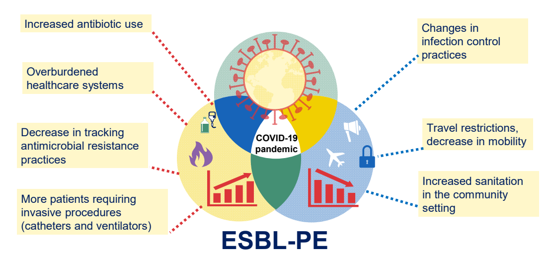
Figure 2. The COVID-19 pandemic and its potential effects on ESBL-PE infections.

In conclusion, while the impact of the COVID-19 pandemic on the epidemiology of ESBL-PE infections is not yet fully understood, it underscores the importance of continued efforts to address the problem of antibiotic resistance, including the development of new antibiotics and alternative therapies, improved infection control measures, and the importance of antibiotic stewardship programs.