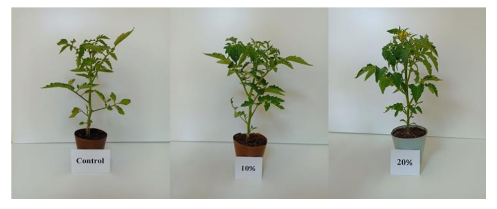
Figure 1. Tomato seedlings grown in solid grain waste digestate (peat-digestate) and peat substrate's mixtures: control (peat), peat +10% peat-digestate, peat+20% peat-digestate.

The investigation was carried out at the Institute of Horticulture, Lithuanian Research Centre for Agriculture and Forestry in unheated greenhouses covered with a double polymer film. Two factors were investigated: seedlings establishment method (transplanted and direct sowed in the pod seedlings) and different substrates: control (peat, Profi 1), peat +10% peat-digestate, peat+20% peat-digestate. The transplanted tomatoes were sown in the middle of February and direct sowed in the pod seedlings–at the end of February, both were kept under the same conditions in a heated nursery. The plants were watered when necessary. The seedlings were cultivated for 60 days. The investigation object was the variant "Brooklyn H". At the beginning of May, the seedlings were transported to unheated greenhouses. Three replications were done in a randomized block design.