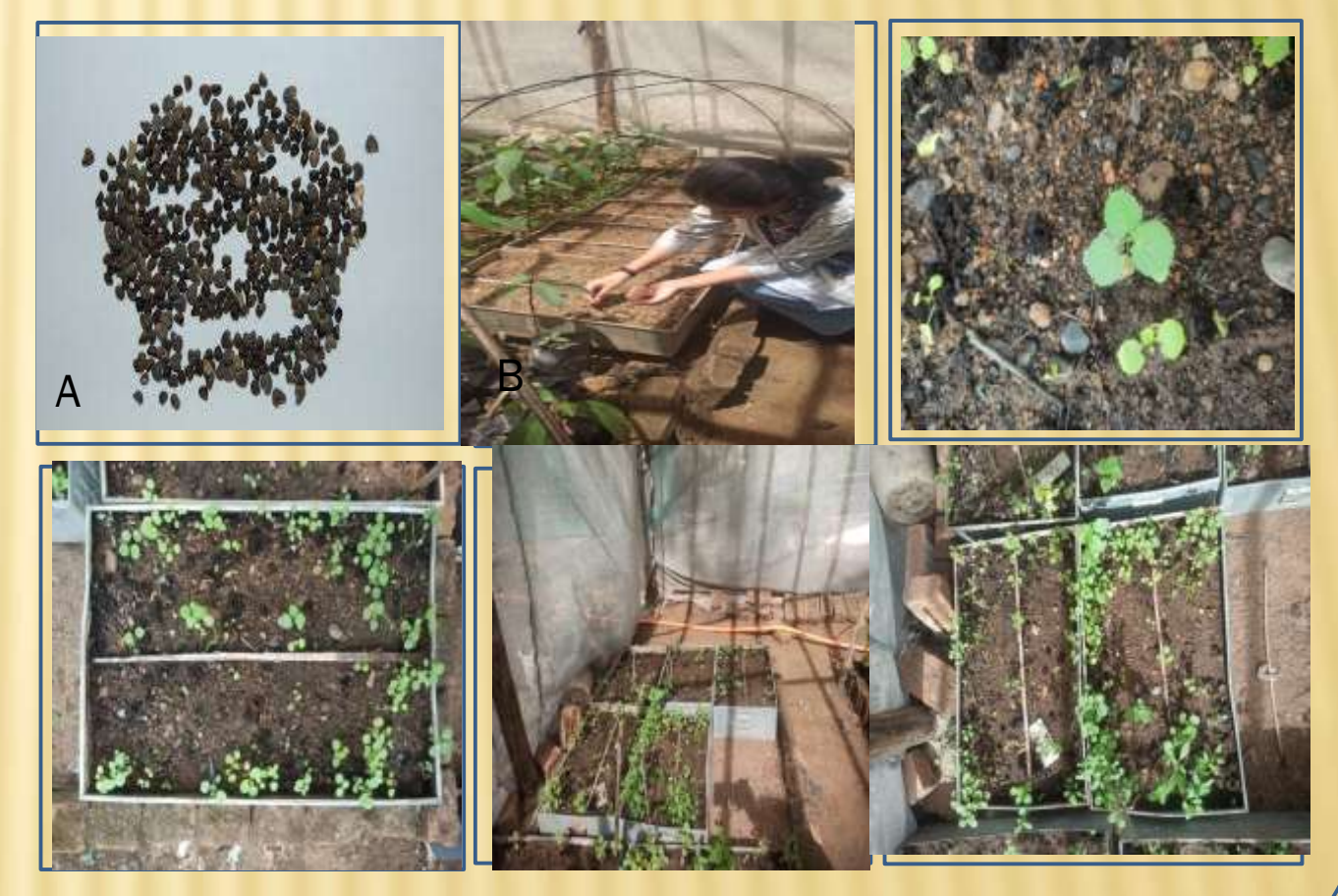
Fig 3.Pre sowing treatments in seed germination of S. cordifolia in nursery (A) Mature seeds, Emerged seedling with growth in T_5 (Conc. Sulphuric acid)