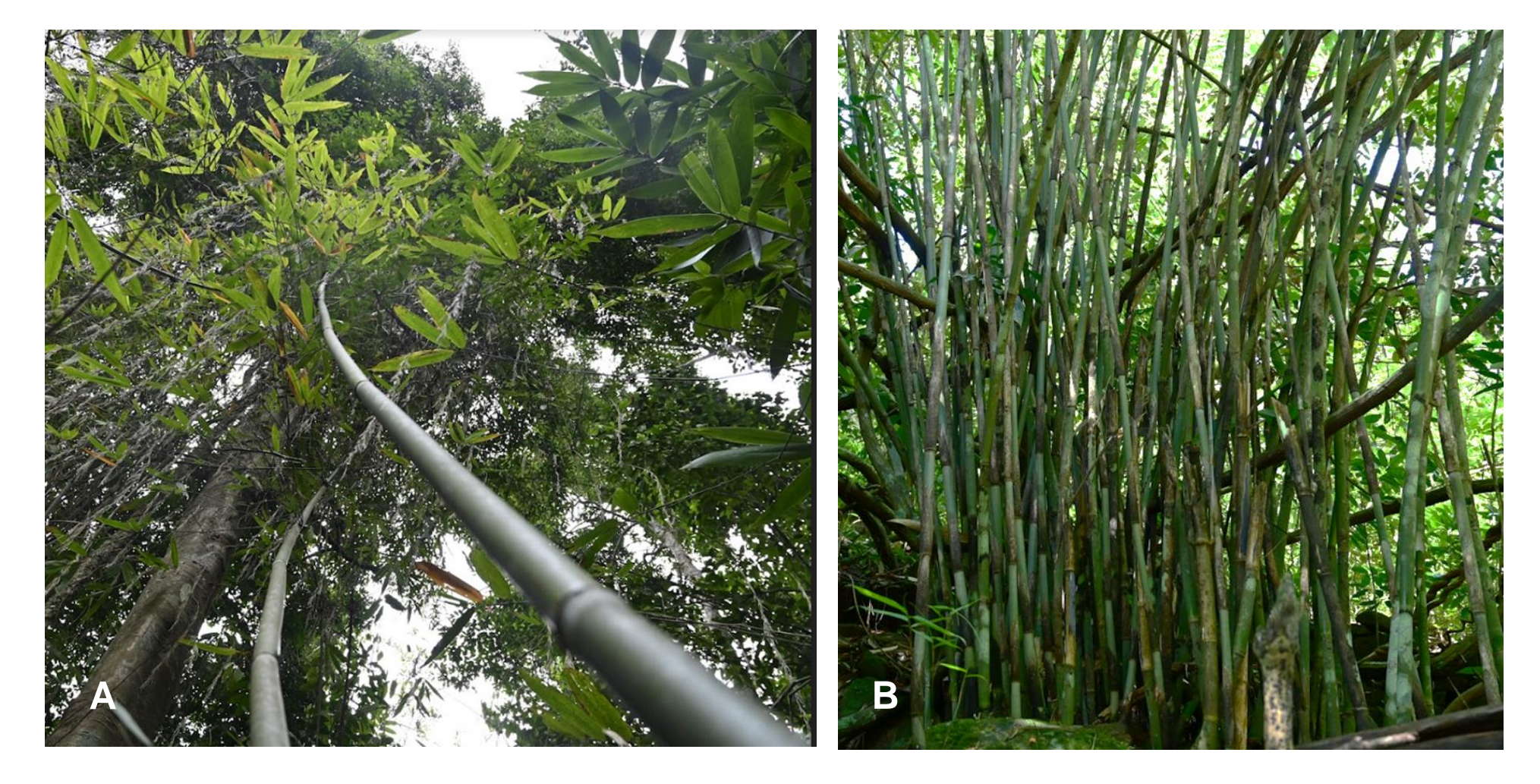
Fig 3: Habit - A- T. wightii B – O. travancorica

Two endemic thin-walled bamboos; Teinostachyum wightii Bedd. & Ochlandra travancorica (Bedd.) Benth of one-year-old are used for mat weaving by the communities with the former being the most preferred species.