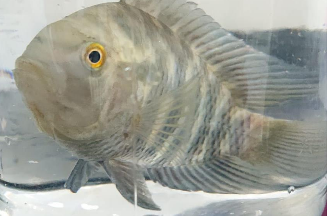
Figure 1: Australoheros facetus

energetics, and ecological interactions, and can be applied directly in widely different research fields (Clark, 2022). In this sense, providing these metabolic estimates will prove an ideal complement to past and future research on the physiology of A. facetus focused on unraveling its interactions with the environment, its adaptability and its effectiveness at invading foreign habitats.