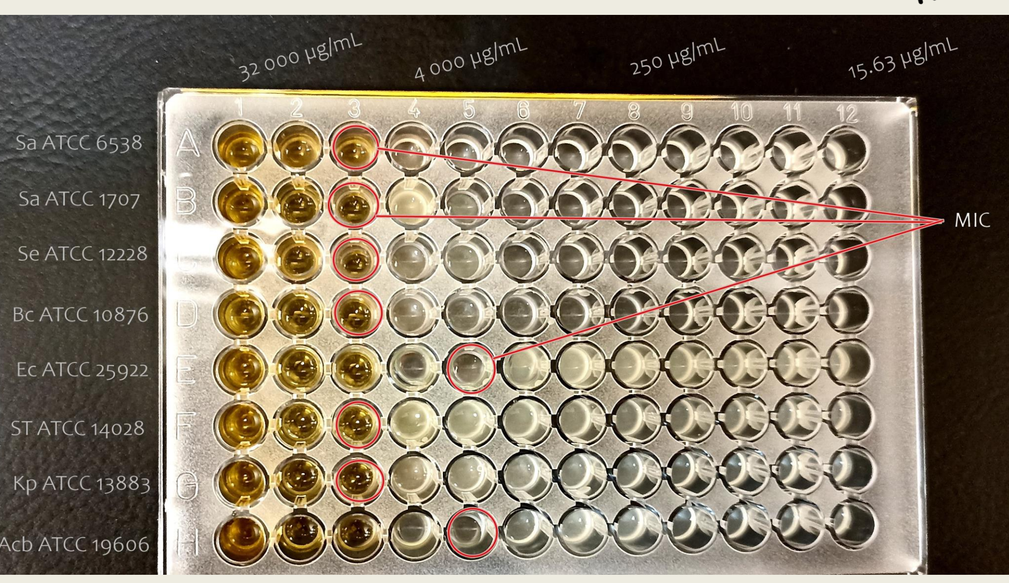
Figure 2. Microtitre plate with antibacterial activity of the fermented freeze-dried beetroot juice powdered with 20% oligofructose against Gram-positive and Gram-negative bacteria

The results highlight the antimicrobial potential of probiotic beetroot juices (PBJs), demonstrating effective activity against selected gastrointestinal or foodborne pathogens such as E. coli, Salmonella spp. (typically associated with foodborne illness) or A. baumannii (rarely associated with diarrheal illness). They are among the most common Gram-negative pathogens that poses major threat to human life. Thus the novel foodstuffs obtained might be a more convenient food formulations with significant technological and human health protection potential.