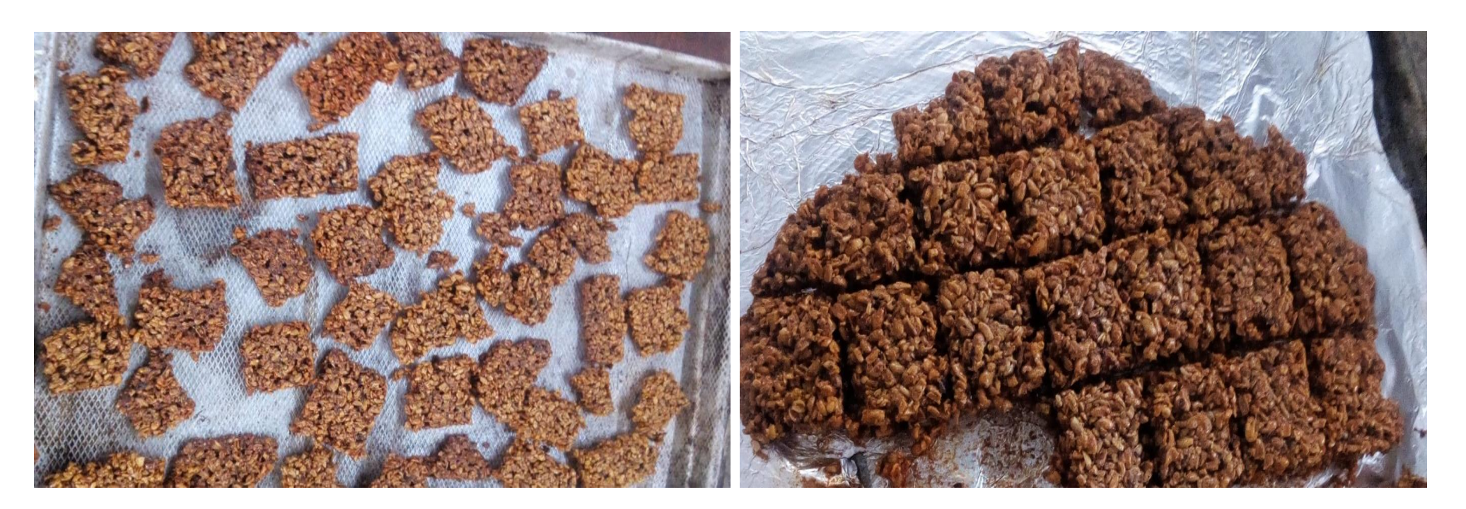
Plate 3: 100% African breadfruit grits chewy snack bar

Fig. 1: Processing of dehulled toasted African Breadfruit seeds (Opoku et al., 2013 with modifications.