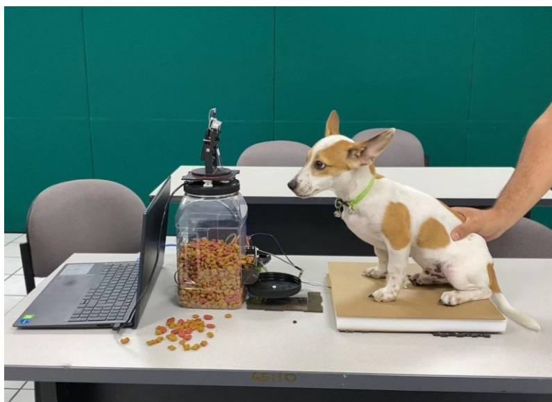
Figure 2. Smart pet feeder prototype.

Testing demonstrated that the system effectively identified pets, dispensed appropriate food portions based on weight, and provided real-time monitoring. The YoloV5 model consistently identified dogs with high precision, as seen on Figure 3.