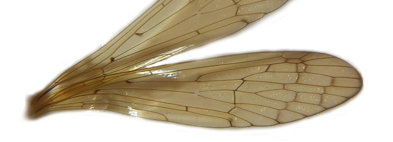
Fig. 1. Bittacus hageni, female individual. Top left, photo in situ. Top right, preserved habitus, ventral view. Bottom, wings, detail.