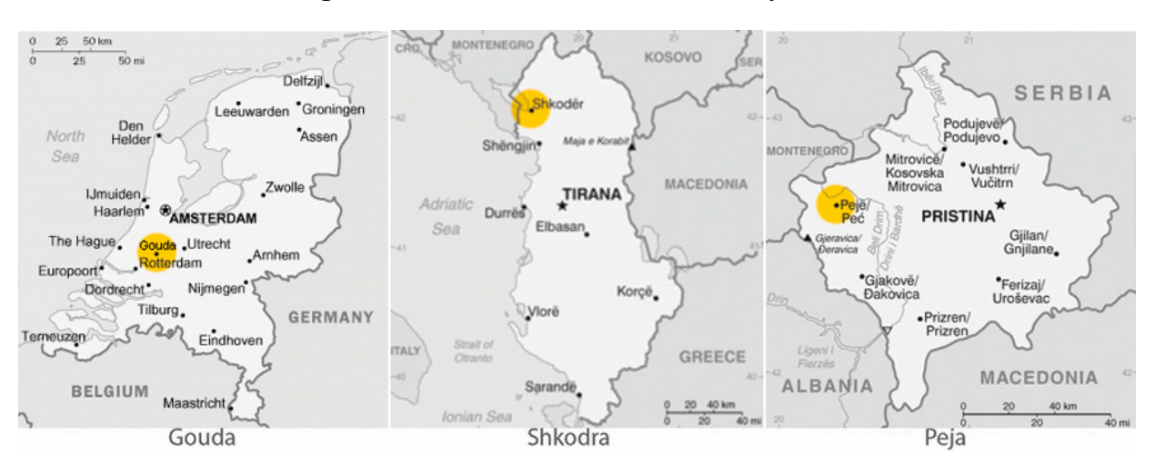
Figure 2. Location of the three case study cities.