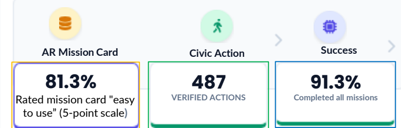
Figure 4. Citizen Sensing

WeAR Smart personalized education into actionable city intelligence: