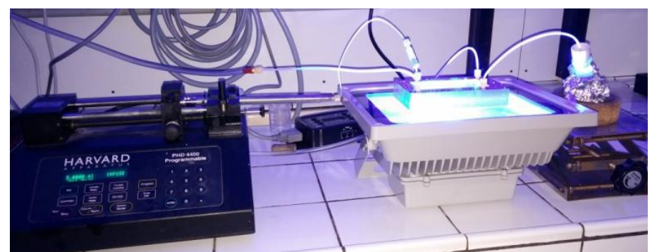
Figure 1: Reaction set-up incorporating dwell device photomicroreactor

A microreactor (dwell device manufactured by Mikroglass Chemtech Mainz, Germany) with a rectangular shape of dimensions 115 \text{ mm} \times 2 \text{ mm} \times 0.5 \text{ mm} was used as photomicroreactor (Figure 1). The relatively small depth (500 micron) ensures homogeneous illumination of the reaction mixture which, in contrary to batch conditions, prevents the formation of hot spots and exhibits better efficiency as the desired product is formed without the need of the usage of high power mercury lamps. Moreover this microreactor is made up of glass that is transparent up to 300 nm allowing to work at a wide range of wavelengths (UV & visible) where all of the photons delivered by the lamp are strictly absorbed by the reaction mixture. In order to control the temperature cooling channel was connected to a MultiTemp III thermostatic circulator (Amersham Biosciences).