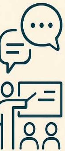
Figure 2. Intergroup interaction, communication clarity, and perceived barriers across language tracks in emergency medical students