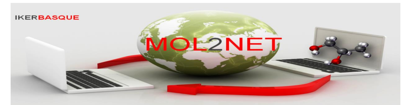
SciForum MOL2NET Comparative Modeling of the Three-Dimensional Structure of Protein Kinase D from Mycobacterium Tuberculosis.