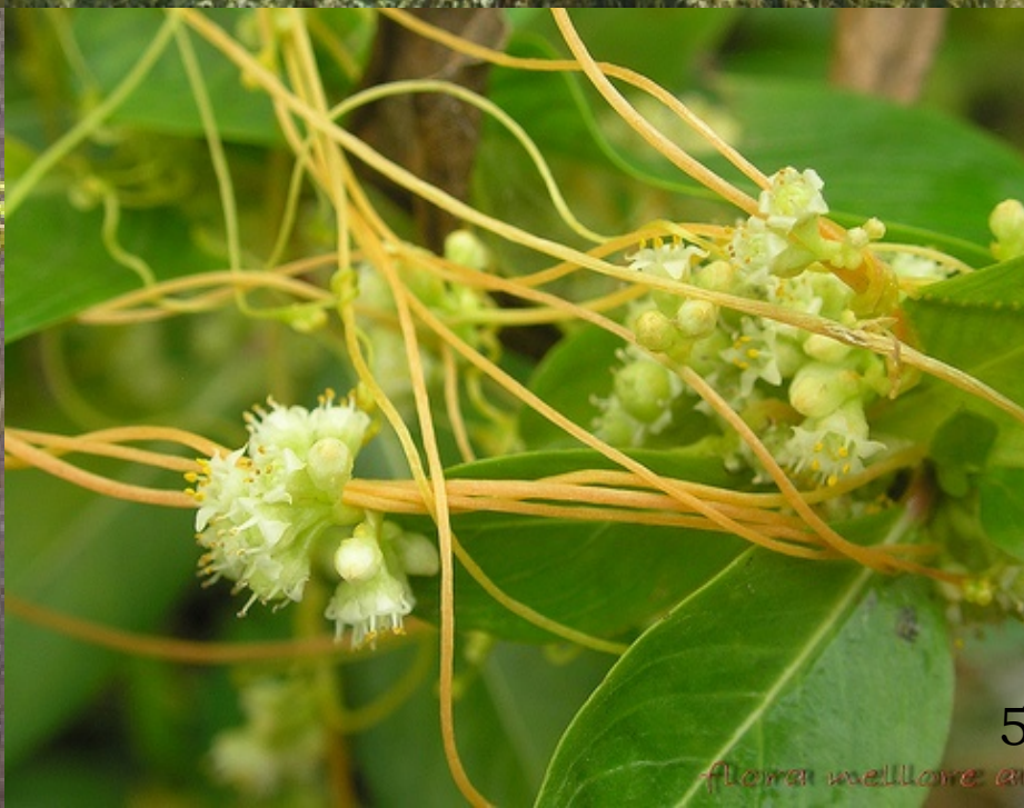
flora mellone a1