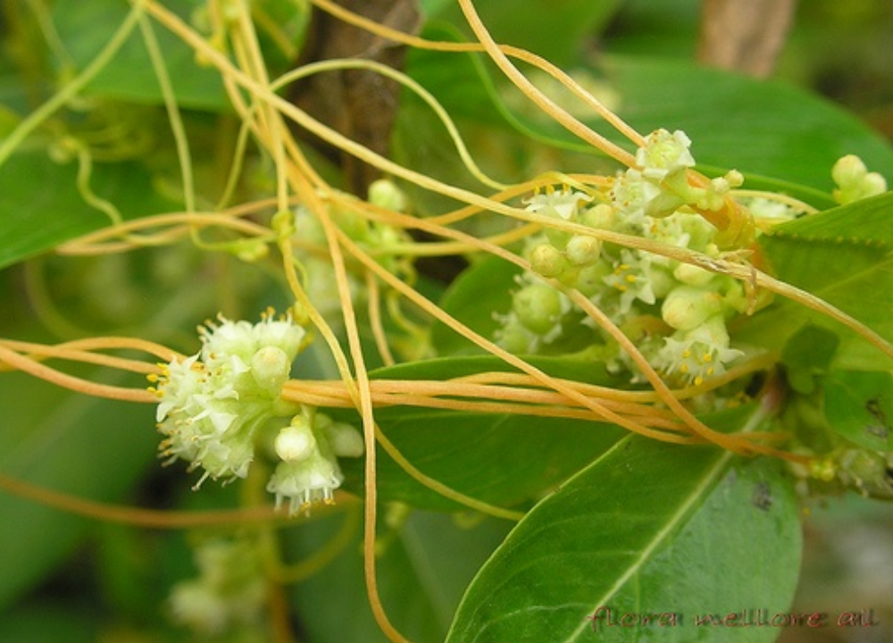
flora mellone a1