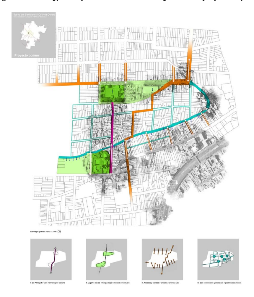
Figure 2. Strategy to improve the Santuario neighborhood proposed by the students