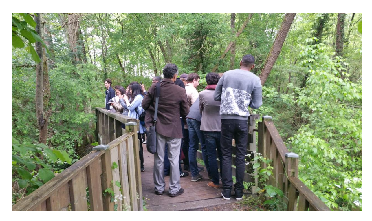
Figure 5. View of the visit of Jalle and its surroundings

Articulating with a reflection undertaken by the municipality to repair this situation and requalify the center of the city, while encouraging a real connection with the Jalle , the workshops aimed to reflect on the creation of new urban situations generating a new identity, capable to promote an intense dialogue between the city and its natural environment.