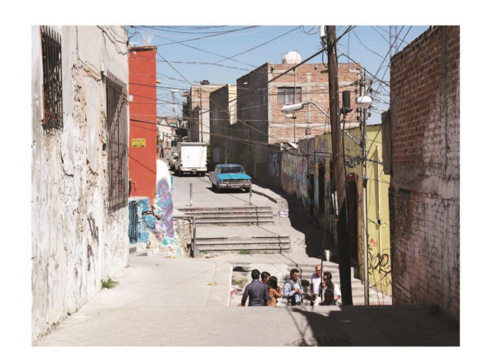
Figure 3. Current status and proposed improvement of public space on Hermenegildo Galeana Street