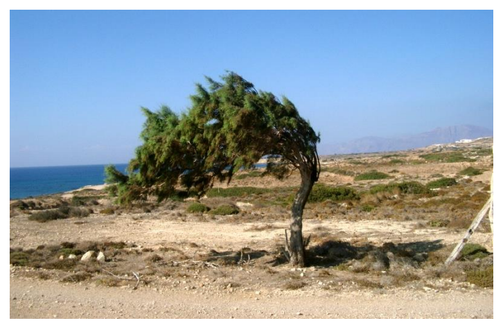
Figure 2: A resilient tree in the storm

Resilience is a key characteristic of critical infrastructure systems (Zabrowsi & Sage 2017). It basically describes that a system, no matter on which scale, needs to have two key abilities: robustness and adaptive capacity. Based on these abilities, it can withstand external shocks and remain functional. Very much like a tree in a storm, whose trunk and branches are bending and adapting to avoid to be broken by the wind, whose roots, however, remain robust to keep the tree stable (for further examples see e.g. <u>Resilience Alliance Database</u>).