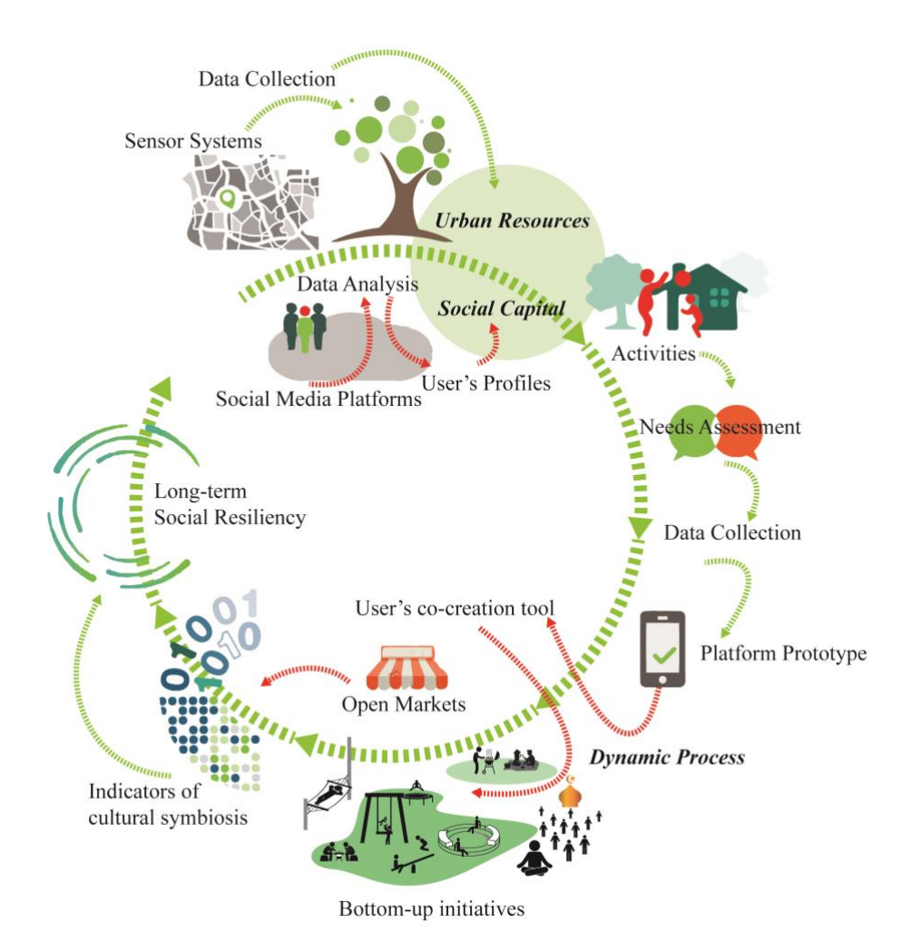
Figure 3. The research model