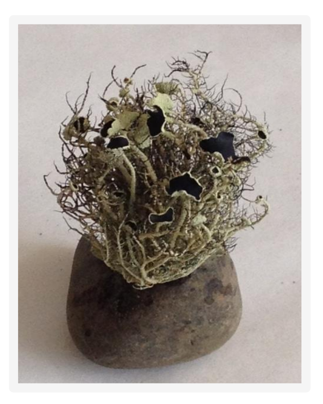
Figure 1. Specimen of Usnea aurantiaco-atra. (Jacq) Bory

As the lichen flora from the Antarctic region, remarkable for its variety and development, represents a potential source of new bioactive compounds, we have undertaken a biological screening to detect cytotoxic activity and antioxidant activity of the lichen extracts of the Usnea Aurantiaco-Atra .