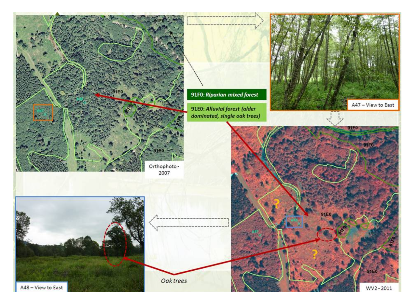
Figure 3. Changes in habitat type 91E0 indicated by analysis of recent Worldview-II imagery. Only larger oak trees remained after clear cut.

the site is the fragmentation of habitats by forest plantations with Picea abies, Popolus canadensis . Continuous urbanisation (and the demand for a bridge construction), the presence of invasive nonnative species (neophytes) and fungal parasitism on ashes are further pressures on the natural distribution of potential habitat types. The change of the endangered habitat types is now detected by Worldview-2 satellite imagery composed of 8 spectral bands (with a spatial resolution of 1 m): Coastal (400 – 450 nm), Blue (450-510 nm), Green (510-580 nm), Yellow (585 - 625 nm), Red (630-690 nm), Red Edge (705 - 745 nm), NIR1 (770-895), NIR2 (860 - 1040 nm) and one PAN (delivered spatial resolution 0,5 m). Preliminary analysis results based on object-based image analysis (OBIA) are promising for species (appropriate to habitat types) and vitality detection by using a combination of Coastal, Green, Red Edge and NIR1.