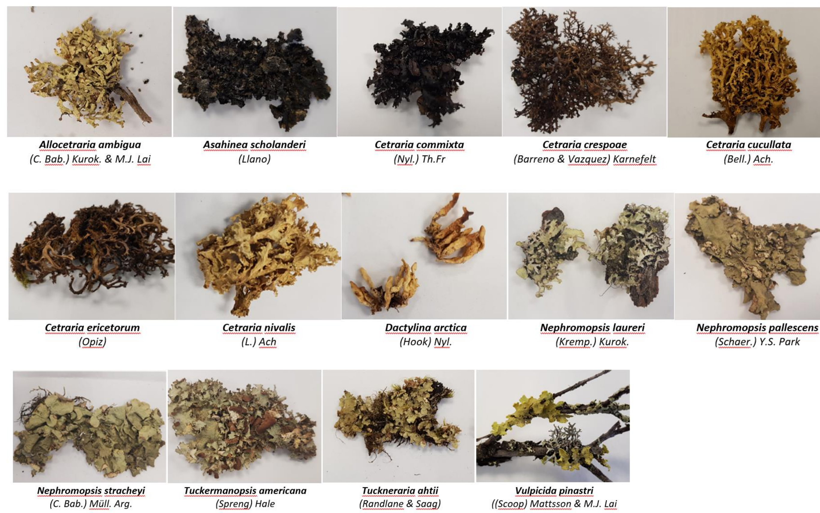
Figure 1. Thallus of the studied lichens of Cetrarioid clade.