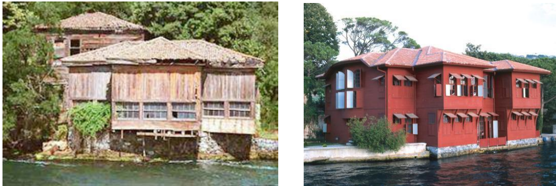
Figure 10. Wooden materials usage in houses

Eriç(1988), states that Turkey has unique weather conditions caused by its geographical structure as; being surrounded with seas, the relation of the mountains with the sea and the variety in ground shapes. The wooden houses which are the best examples of civil architectural heritage in Turkey are located especially near shore and forest sides, densely in the Marmara, the Black sea, and the Aegean regions. Economical and technological reasons had given rise wooden to be used as a building material for centuries. Oztürk (2004),classifies the properties of wood that have been satisfying people's needs as; its high carrying strength, its resistance to earthquake and other natural disasters, its great resistance to fire and its being the only renewable source for building(fig.11).