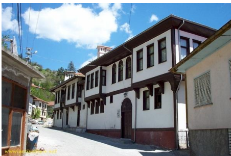
Figure 2. Traditional Hatıl Construction in Taraklı/Turkey