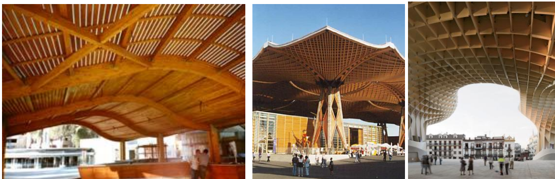
Figure 8. Examples of Laminated Wood Technology from the World

As Oztürk states(2004), wood processing techniques come to construction systems over again by development studies of the researchers and construction engineers. As an example; dividing the whole wood into smaller pieces for eliminating the disadvantages of organic properties and meddling to the factors like; humidity and fiber structure that are able to work the organism and combining with physical operations and additives that are able to block deformation is not a many much recent idea (Tokyay,2001). Laminated wood or layered wood technology has short history on structural purposes opposite of minor scaled units. Today, by the developed technology and chemical industry, glued combinations of wood gained stronger resistant than natural wood pieces. To produce structural elements that never lose resistance in adhesion processes in all exposed conditions, including tropical weather conditions, is possible with present glue types and glue based developed techniques. Thus, construction components that are used in different forms and for big open spaces, can be produced by using laminated wood technology (fig.8). These construction components can be produced in many different formations like; flat and curve beams, arcs, shears, and knuckles. All details and metal accessories for combinations are completed industrially in factories (Duman,1964).