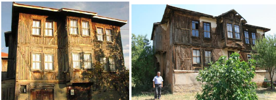
Figure 4. Traditional timber framed house with wood infill “Dizeme” construction in Turkey