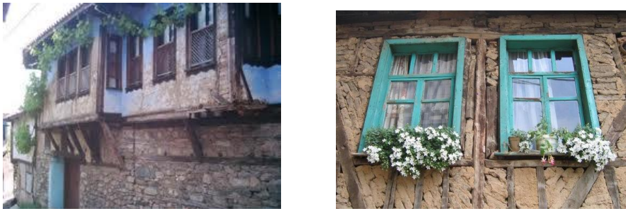
Figure 3. Traditional Hıms House in Cumalıkızık/Turkey