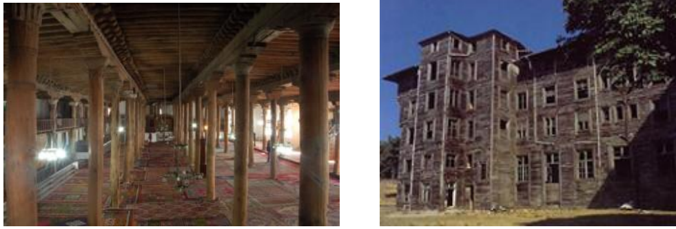
Figure 11. Wooden materials usage in public buildings

The properties of traditional wooden construction systems mentioned above improve their self-sufficiency which is one of the most important necessities of sustainable development as indicated in the previous sections. The life time environmental impact of traditional Turkish wooden buildings are lower than any other kind of buildings through their properties that reduce the energy and resources used and waste produced at each stage of the building life cycle – construction, occupation and demolition.