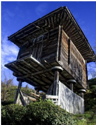
Figure 1. Traditional log houses, Black Sea Region