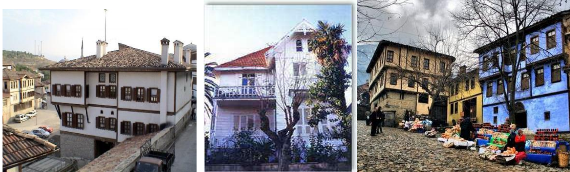
Figure 9. The examples of wooden architecture in Turkey

On the other hand, it can be said that wood is the best loved of the building materials with its natural and organic qualities. The transformation of its colour and texture through ageing, bleaching by the sun, eroding by rain, worn by the passage of feet and the rubbing of hands, is considered as valuable (fig 10).