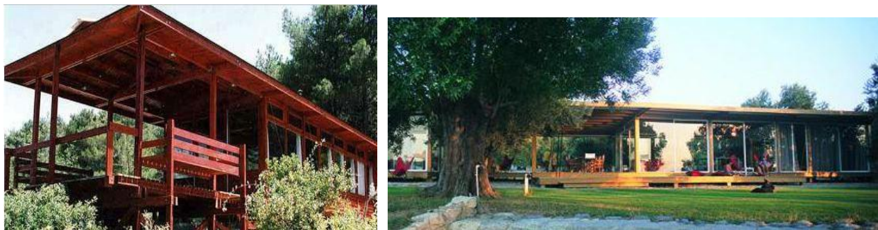
Figure 6. Contemporary wooden buildings constructed with traditional systems in Turkey

Today, new wooden houses are still being constructed with traditional construction systems in Turkey(fig 6). On the other hand, laminated wood technology that provides many advantages for architectural design is used for construction of various kinds of buildings(fig.7).