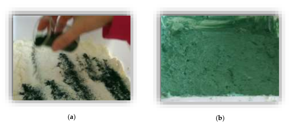
Figure 2. (a) Addition of powder spirulina in fresh cheese; (b) Fresh cheese type-Galotyri with incorporated Spirulina platensis .

The chemical composition of galotyri was determined during storage at 4 °C after two days of production (Table 1). Products of microalgae origin have been widely used as a high-protein supplements especially in human nutrition as well as for nutraceutical purposes. In the present study a slight rase in protein content was observed as the content of incorporated spirulina was incorporated in higher amounts. This result was mostly expected as Spirulina platensis is one of the most nutritious microalgae known containing a wide capacity of essential amino acids and protein content of up to 70% of its dry biomass [4].