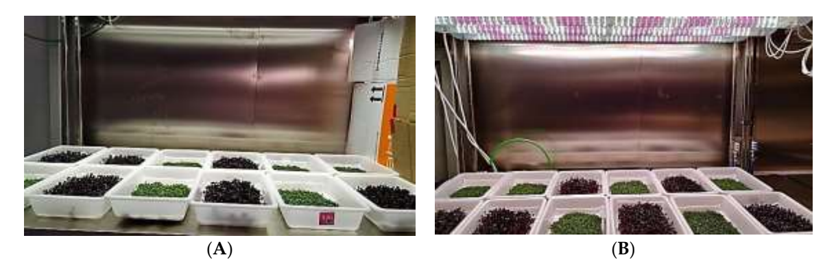
Figure 1. White Mustard, Broccoli, Red Cabbage and Red Radish, under the two different LED lighting comparing Commercial ( A ) versus Experimental LEDs ( B ).

The expression of phenotype of the cruciferous varieties was the characteristic of each variety, the pigment composition of the different varieties was expressed in the differential aspect of the different sprouts shoeing the clear green color of the mustard in contrast to dark green color of broccoli and the reddish tone of the red cabbage with the deep brown-red color of the radish (Figure 1).