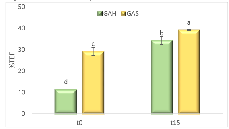
Figure 1. Emulsion stability measured as g of total liquid expelled/100 g sample. Values followed by the same lowercase letter there are no statistically significant differences (p > 0.05) according to the Tukey multiple range test.

The results of the stability of the emulsion are calculated by determining the total exudate fluids (TEF), the results obtained for the different samples of gelled emulsions are shown below in Figure 1. The lower the TEF, the greater the stability of the emulsion. It is observed in Figure 1 that there are statistically significant differences (p < 0.05) for both samples. At time 0, the sample that presented the greatest stability of the emulsion was GAH (11.32 ± 0.66), followed by the GAS sample at time 0 (29.16 ± 1.87). After freezing, the most stable is GAH, but its instability increased by 22.9% and for GAS the instability is less pronounced with an increase of 10%. Several previous studies have published that the addition of dietary fiber to meat products helps to improve the stability of the stability of the stability of the addition of they are intended.