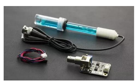
(c) pH Sensor.