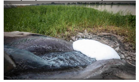
( a ) Factories discharge wastewater directly into the river [5].

In this paper an IoT based smart water monitoring system for fish farming in Bangladesh is proposed. This IoT based smart system will efficiently measure quality parameters of the water. It is a sensor based network which has the ability to sense the quality of the elements of the water such as dissolved oxygen, Nitrogen, pH ,water temperature, nitrite, ammonium, Co2, and it will be sent the measured data by sensors to a mobile via a mobile application. Looking at the measured values of water quality factors in the mobile phone, fish farmers can take necessary steps to solve this.