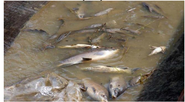
(b) Fishes died from water pollution [2].

Figure 1. (a) Factories discharge wastewater directly into the river. (b) Fishes died from water pollution.