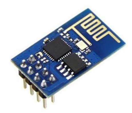
( d ) Wifi Module.

Figure 4. The harware components (a) Temperature sensor, (b) Arduino Uno microcontroller, (c) pH sensor (d) Wifi Module.