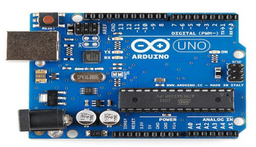
(b) Arduino Uno microcontroller.