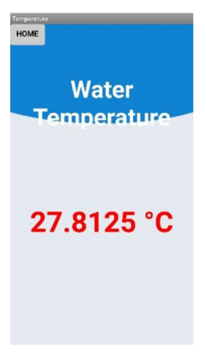
Figure 5. The developed mobile application shwoing temperature level of the water.

Author is currently working for the implementation of this. Author is preparing an article with the results of the whole new system and it will be submitted in MDPI Water Journal. For fish farming water quality can be maintained if we keep pH, dissolved Oxygen, Nitrates and Ammonium, temperature in control. Ammonia is harmful for fishes as it comes from the waste products of the fishes so regularly eliminating it off the water is essential. The application of this proposed system is not only limited to fish farming in Bangladesh but it has other applications in many areas. Our future plan is to scale up this system and apply to other areas as well to monitor water pollution.