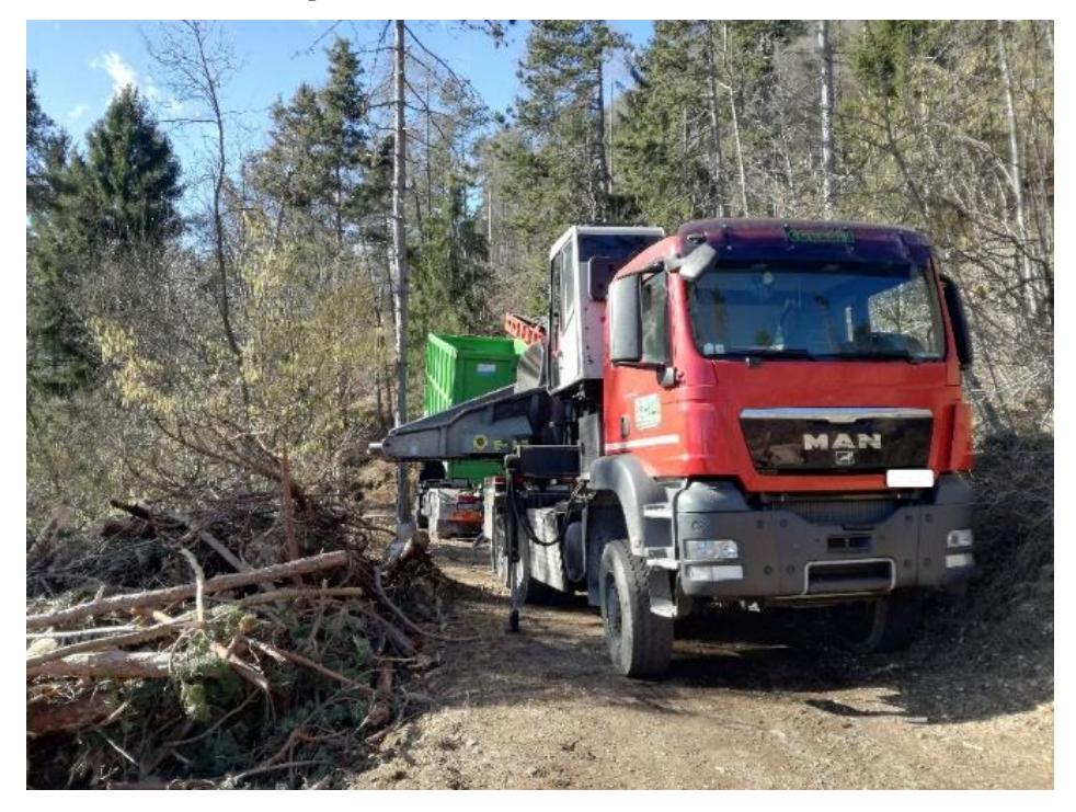
Figure 1. - Mus-Max Wood Terminator 10 XL chipper truck.

The chipper-truck was based on chipper unit, a Mus-Max Wood Terminator 10 XL, mounted on a three-axles MAN truck, a MAN TGS-28.540. 397 kW truck's engine powered the chipper unit. Chipping operations were carried out by the operators from the external cabin (Figure 1). Net productivity declared by the manufacturer is 180 m<sup>3</sup>/h. Details of the machine are reported in Table 1.