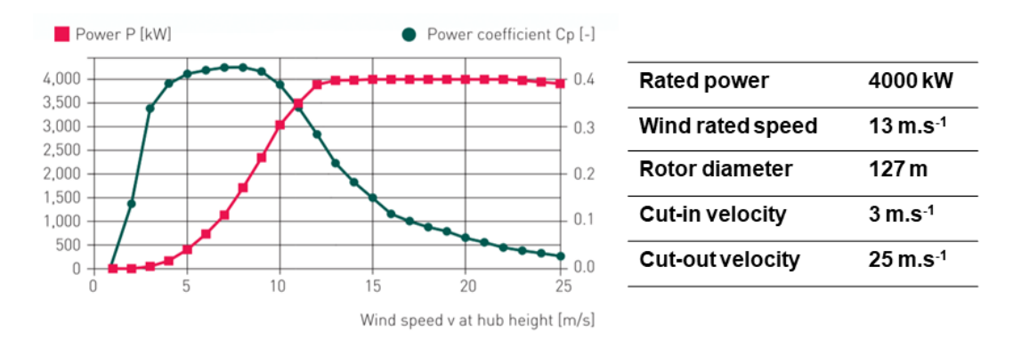
Figure 1. Power curve (in kW) of the selected wind turbine (4 MW E-126 EP3, ENERCON) for wind speed ranging from 0 to over the cut-out velocity (25 ms<sup>-1</sup>). Note the rated (maximum) power of 4000 kW, wind rated speed of 13 ms<sup>-1</sup> (outlined by the vertical dotted line), rotor diameter of 127 m and cut-in velocity of 3 ms<sup>-1</sup>. Adapted from: [20, 30].

For this study, the turbine ENERCON of the model 4MW E-126 EP3 is used and the characteristics are presented in Figure 1 [20, 30].