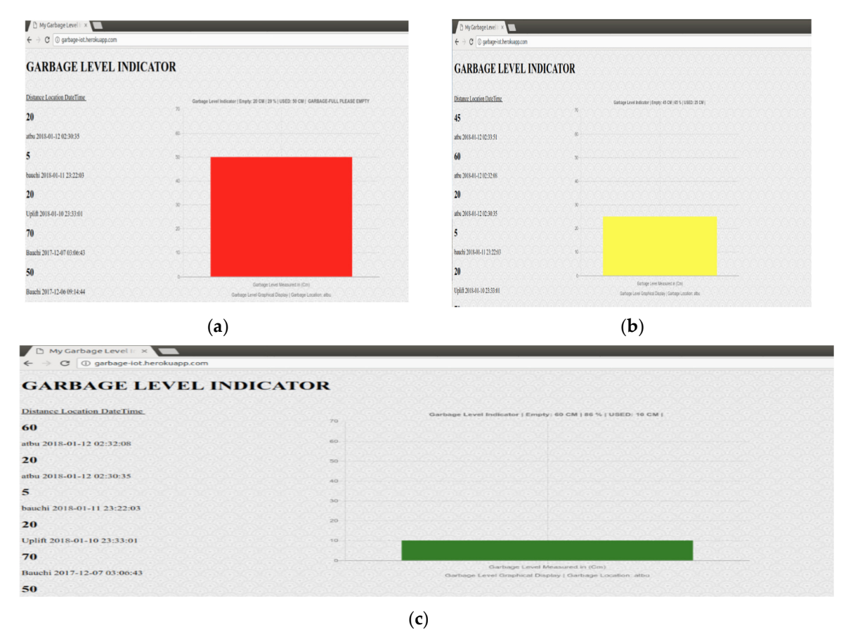
Figure 3. (a) The garbage status is almost FILLED, is due for collection (b) The garbage status is HALF-FILLED (c) The garbage status is almost EMPTY.

In a highly populated city, this will help to keep the cities clean and tidy. In addition, this will ensure enormous advances in technology most especially in this present age where there is a tremendous advancement in creativity and in using technology to better the lives of the smart city dwellers and the environment.