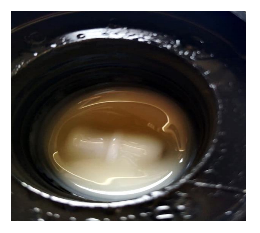
Figure A1. Optimized organogel formulation (Batch PL4).