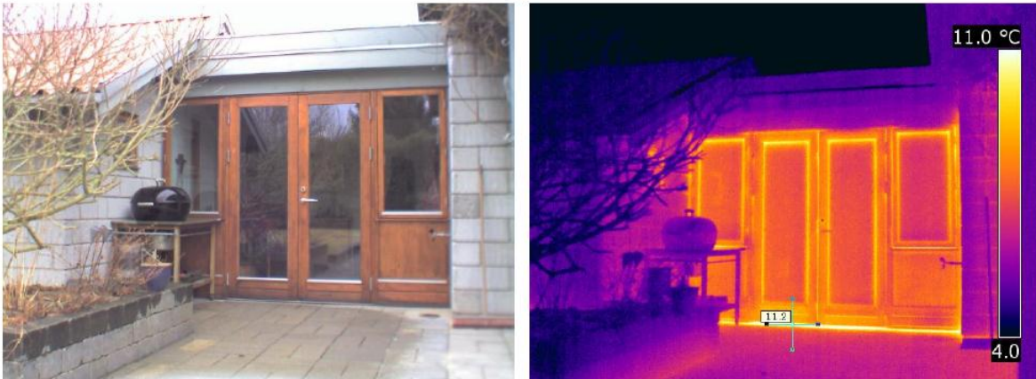
Figure 3. Poorly insulated window/door section along a corridor that connects the main house with an annex. The U-value is measured to be U-value=1.44 (Id 1, the wood parapet). The outer wall next to the window/door section was measured to be U-value=0.80 (Id 2). See Table 1 for measured U-values.

T_{in} is higher than T_{out} for the situations in figures 3 to 5. Figure 3 and 4 are thermographics taken from outside the building and figure 5 is from inside the building. The dark shaded (blue/violet) areas on figure 3 and 4 represents cold surfaces and thereby more heat insulated than the yellow/orange areas with higher outside surface temperatures caused by poor insulation.