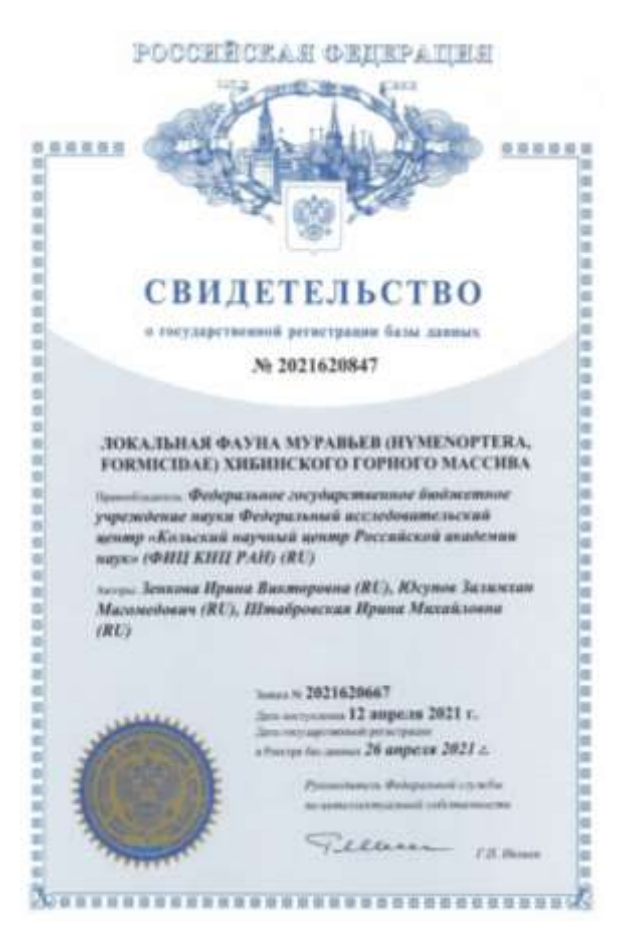
Figure 2. The Database Certificate.

The Database was registered in the "Rospatent" Federal Service for Intellectual Property of Russia (https://rospatent.gov.ru/). Patenting is confirmed by a Certificate № 2021620847 from April 26, 2021 (in Russian) (Figure 2).