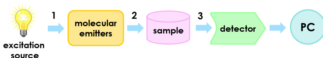
Figure 2. Block diagram of the experimental setup, where 1 – exciting light, 2 – emitted light, 3 – transmitted light.

The block diagram of the experimental setup is shown in Figure 2. In accordance with the proposed optical setup the emission of molecular emitters is excited by the laser diode. The light passed through a sample is registered with a fiber-optic cable connected with a spectrometric detector. Laser diode can be replaced by inexpensive UV flashlight. Another advantage of UV flashlight is that its power is higher than that of the laser diode. Therefore, two optical setups were constructed and compared: with laser diode and with UV flashlight as excitation light.