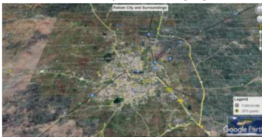
Figure 1. Ratlam City and Surroundings overlaid with GCPs (smartphone A-GPS) on the Google Earth platform

Ratlam District is having an area of about 4,861 km 2 , primarily characterized as relatively plain terrain. It’s located around 23° 20' 3.0084" N and 75° 2' 15.4896" E and is majorly a part of Malwa Plateau. Ratlam city is well known for Gold Jewelry. The study is done in Ratlam city and its surroundings (Figure 1).