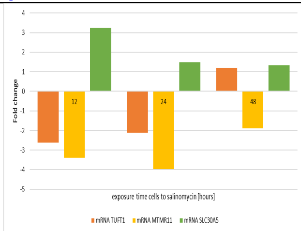
Figure 1. Expression of TUFT1, MTMR11 and SLC30A5 depending on the exposure time of the Ishikawa cell line to salinomycin.

epithelial-mesenchymal transition (EMT); heterogeneity of the cells constituting the tumor mass; the influence of epigenetic factors; as well as any combination of the listed factors.